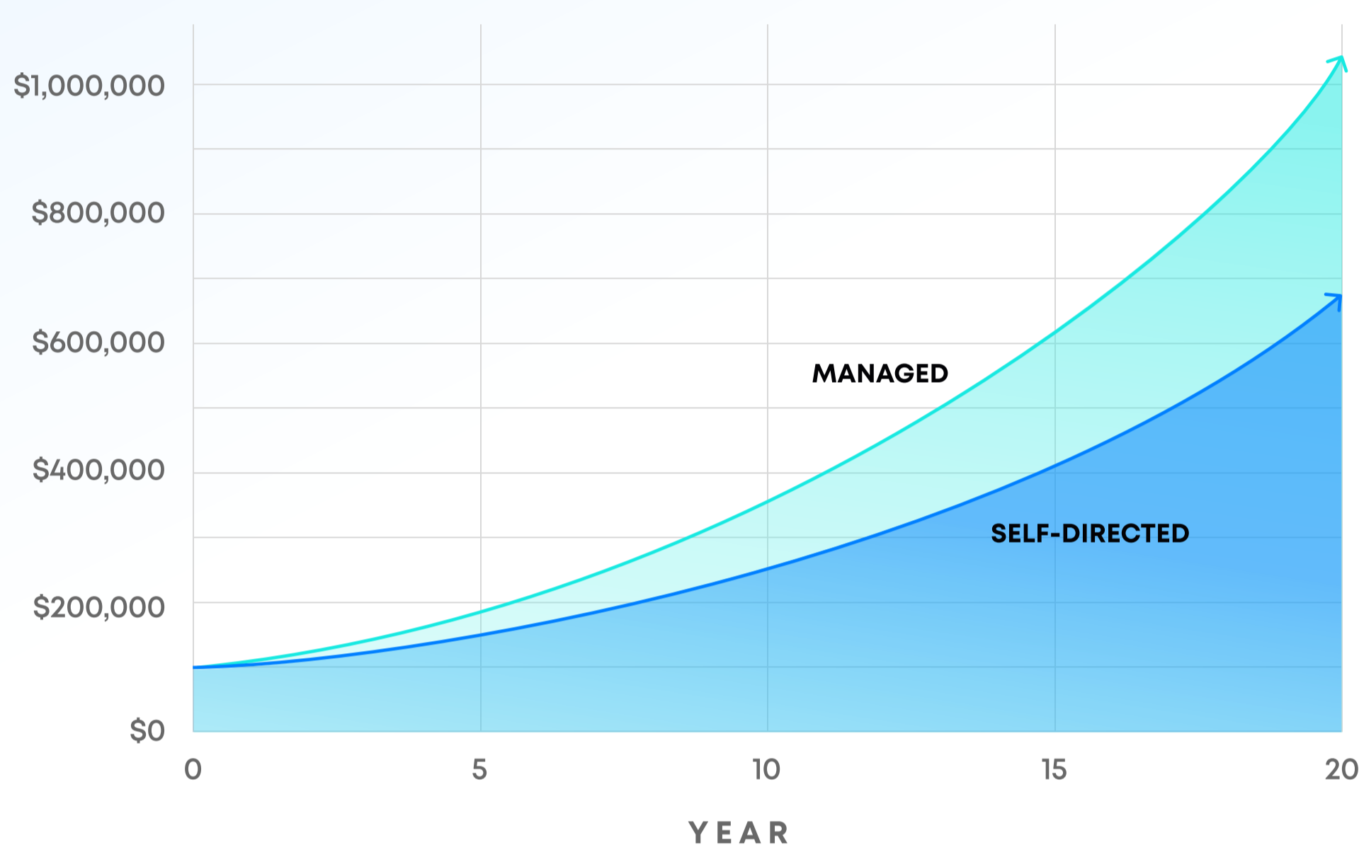
GROWTH IN PROFESSIONALLY MANAGED VS. SELF-DIRECTED 401(K) ACCOUNT

An additional 3% annual return on a 401(k) starting at $100k could yield over 75% more value in 20 years. 5